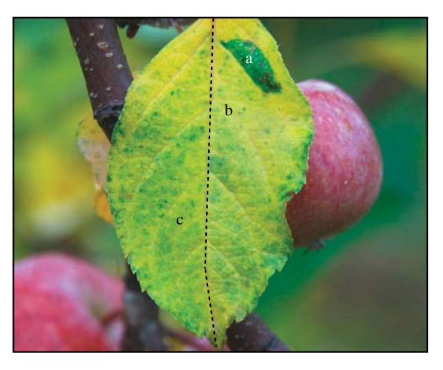
Figure 1. An apple tree leaf infected with the tentiform leafminer Phyllonorycter blancardella larva in autumn. The 'Green island' (feeding area) exhibits intact green chlorophyll-containing tissues, while the remaining leaf tissues undergo leaf senescence. The white spots on the mine are feeding windows, where all but the epidermis has been consumed by the caterpillar. Letters show areas used for cytokinin and nutrient content analysis: 'a' mined, 'b' ipsilateral and 'c' contralateral plant tissues.